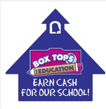
Box Tops for Education